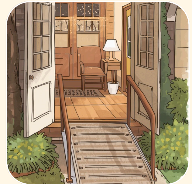
Home Maintenance & Gardening