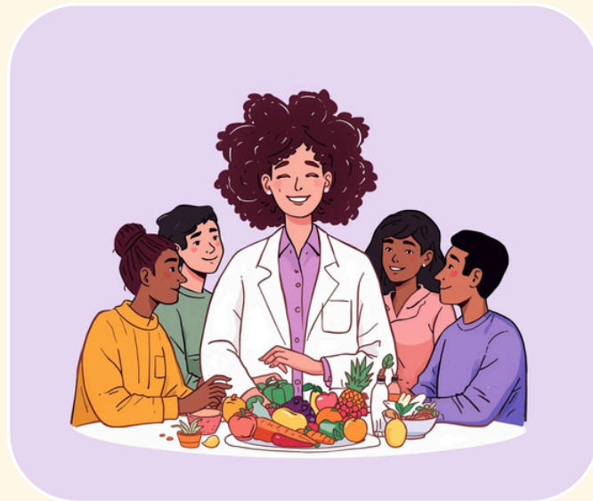
Allied Health & Therapeutic Services