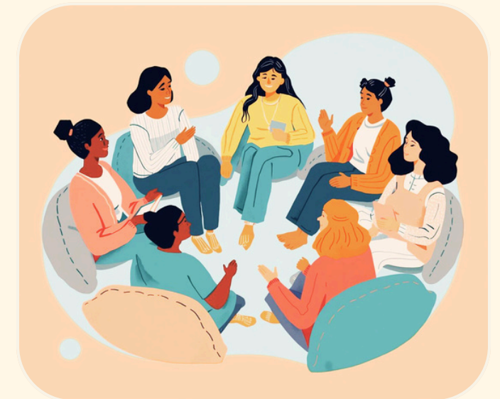
Social Support & Community Engagement & Transport