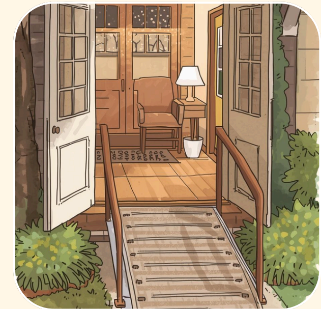
Home Maintenance & Gardening